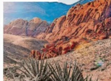
A natural beauty: Red Rock Canyon

Who'd have thought Vegas would be home to a museum dedicated to punk rock?