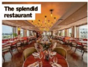
The splendid restaurant

ON THE MENU The menu at the Kitty Hawk Rooftop Bar and Restaurant offered a wonderful array of fresh, vibrant dishes, almost as spectacular as the view. I started with the yellow fin tuna carpaccio (£16), flavoured with sesame, wasabi, and a mango and ginger dressing. For the main, I chose the salt-marsh lamb rack (£38), served with creamed potatoes, an anchovy-crusted heritage carrot, and mint jus which was so excellent I dreamt about it.