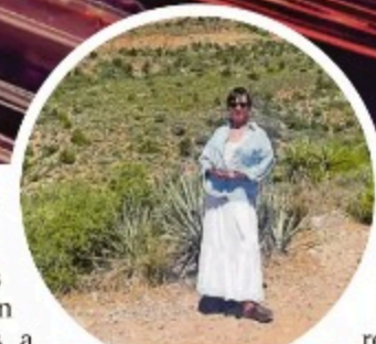
Maria checks out what to see beyond the city

staying slightly off Strip a smart option. Virgin Hotels Las Vegas opened in March 2021 and is a 30-minute walk from the thick of things or a short Uber ride in the soaring 40°C heat.