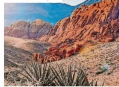
A natural beauty: Red Rock Canyon

“Who'd have thought Vegas would be home to a museum dedicated to punk rock?”