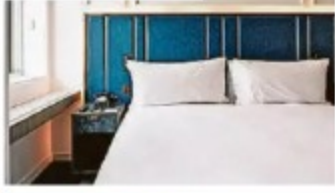
PAGE8 HOTEL Central London

WHERE AND WHY Staying at a hotel in Central London is often reserved for truly special occasions – and this was certainly one of those.