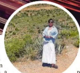
Maria checks out what to see beyond the city

staying slightly off Strip a smart option. Virgin Hotels Las Vegas opened in March 2021 and is a 30-minute walk from the thick of things or a short Uber ride in the soaring 40°C heat.