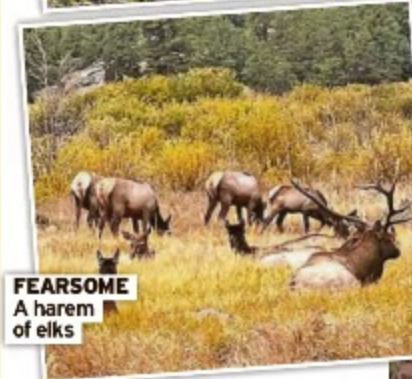
FEARSOME A harem of elks