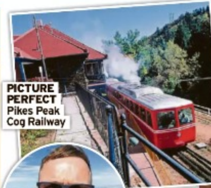
PICTURE PERFECT Pikes Peak Cog Railway

Rooms start at £225 a night, pagehotels.com/en/page8