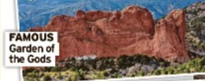
FAMOUS Garden of the Gods